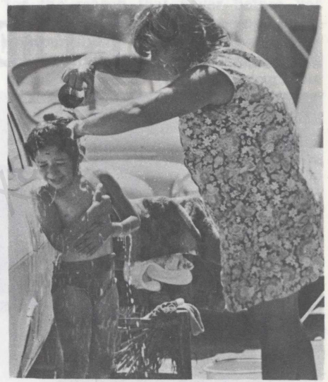
Sanitation facilities desperately needed.

A number of refugees moved to towns and villages where they had relatives or friends or to the Base Areas, but the majority were forced to remain in forests and hills. All these groups need some form of assistance but those living in the open space are in greater, more urgent need. It is these people, 160,000, on whom £2 m. per month must be spent in order to maintain life.