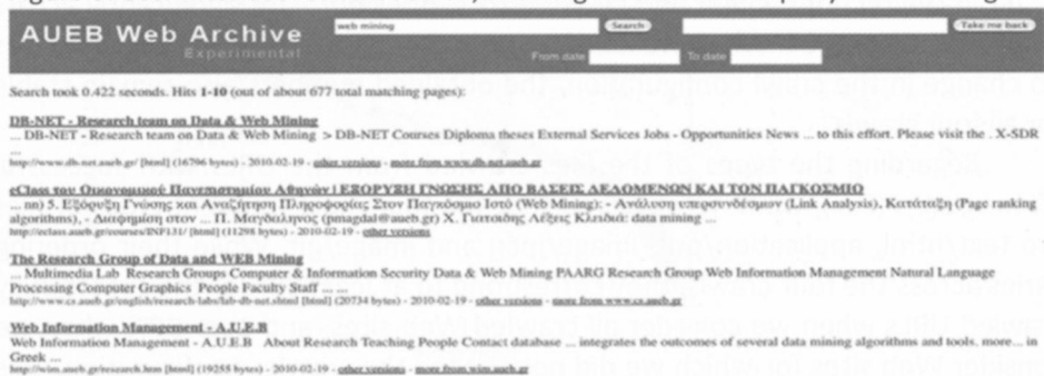
Figure 3: User interface for text search, showing results for the query 'web mining'.

We have collected the content of the Web sites of AUEB several times since February 2010. Here, we describe four crawls we performed between February and May 2010. We initiated each of the crawls from the same set of seed pages, corresponding to top-level Web pages of Web sites in the AUEB domain, using the Heritrix crawler. We changed the configuration of the crawler in order to optimize the crawling of two Web sites, a large forum for undergraduate