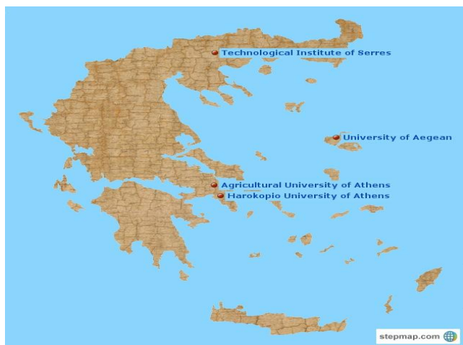
Map1: Geospatial Collections in Greek Academic Libraries

Institutional Repositories are used by all researched libraries for collecting, organizing and preserving grey literature and scholarly publishing of their institutions but there is not any significant collection of the geospatial data that institutions produce through these works or any other research projects they undertake.