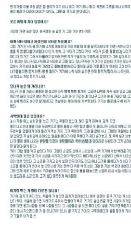
Figure 4. E-Book system.

researchers want introduce to public. Researchers collect data and input them to system. This way, by using completed archives E-Book system, people can check specific traditional knowledge related person or event easily. The frame of the E-Book is made to be similar to actual paper book so people can feel more comfortable using it.