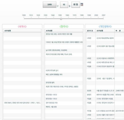
Figure 3. The minjung chronology system.

Korean / local history can be checked immediately. By looking world history and Korean / local history people can check relation of the important event with The Group for the People without History.