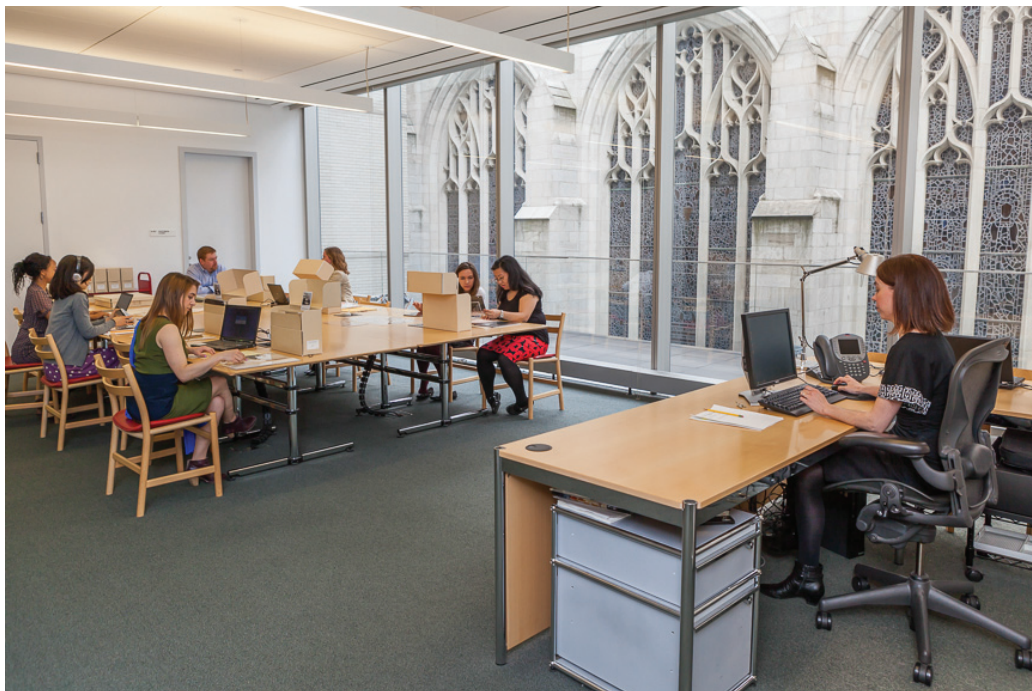
Fig. 4. The MoMA Archives Reading Room.