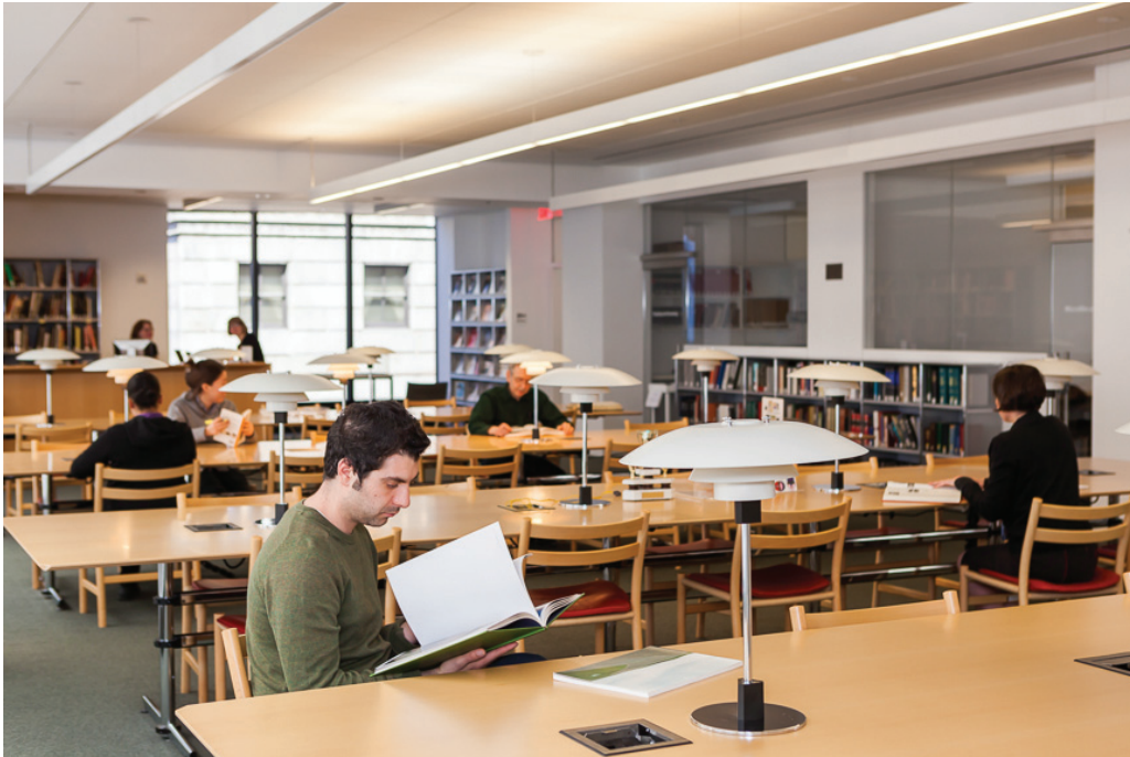
Fig. 3. The MoMA Library Reading Room.