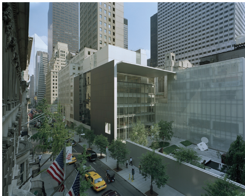
Fig. 2. The Cullman Education and Research Building from 54th Street.

Today, our home is in a beautiful facility which opened to the public in November 2006 after several years of planning, and it has provided us with a showcase for promoting Library and Archival collections. The Lewis B. and Dorothy Cullman Education and Research Building is located on the east side of the MoMA sculpture garden as part of our midtown facility, which was vastly augmented in 2004 and 2006 (see fig. 2). The Library and Archives occupy most of the top three floors, with the public reading rooms located on the sixth floor in a beautiful environment for research and study (see figs 3-4).