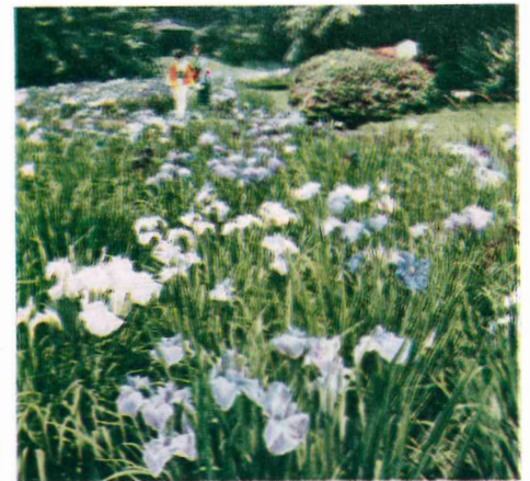
Garden in Early Summer

Japan is a cultural museum where are carefully preserved ages-old art treasures and mementoes of historic interest. Old traditions and legends remain as fresh as ever. Here is a golden chance for visitors from abroad to observe the unique customs and manners of the Japanese people.