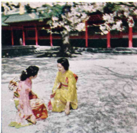
Under the Sakura

golden rice-fields, crimson foliage and rural festivities attract tourists, and in the cold months, various outdoor sports which include golfing, skiing, and skating may be enjoyed to one's heart's content.