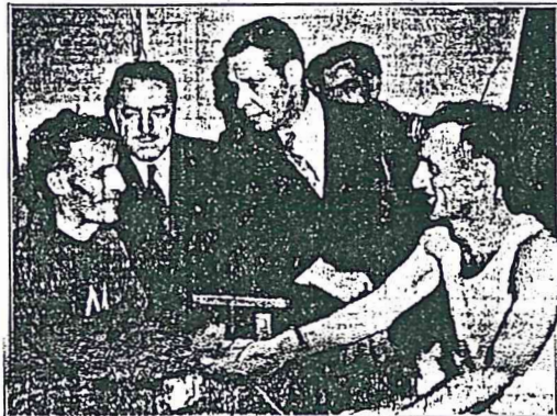
WHEN THE RACE WAS OVER AND WON