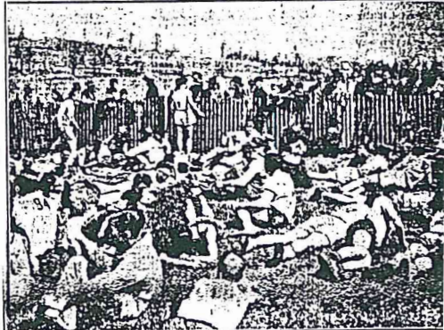
DON'T FENCE ME IN

Here they are—the road grinders themselves, just before the start at Hopkinton yesterday, and all fenced in in the old cinder. Just so they wouldn't be bothered or hampered with, this new feature was added to the 34th