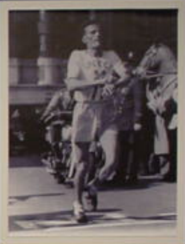
Small yellow caption card next to the large runner photograph.