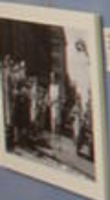
Small text caption for the photograph on the left.