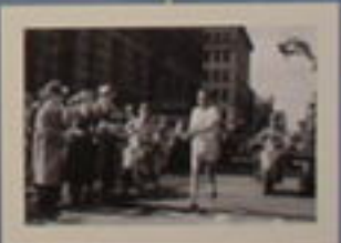
Small yellow caption card next to the group photograph.