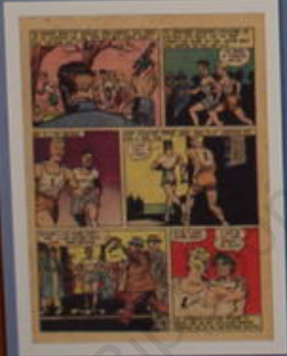
Small caption text below the middle comic book panels.