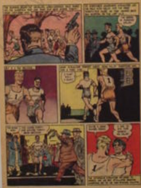
Small text caption for the comic strip on the right.

Headline and text from a newspaper clipping about Kyriakidis begging aid for Greece.