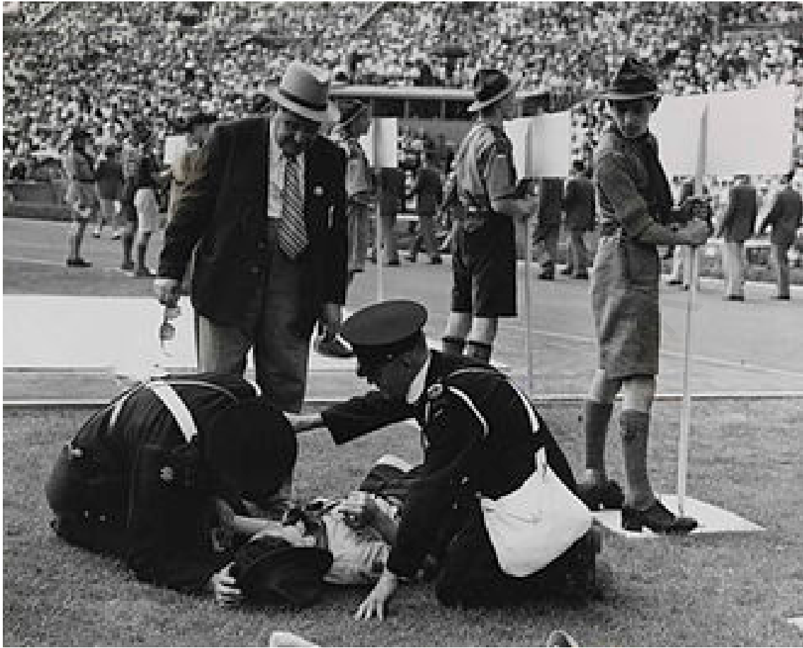
Excessive heat during the games