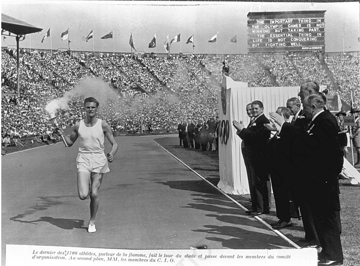
Le dernier des 1700 athlètes, porteur de la flamme, fait le tour du stade et passe devant les membres du comité d'organisation. Au second plan, MM. les membres du C. I. O.