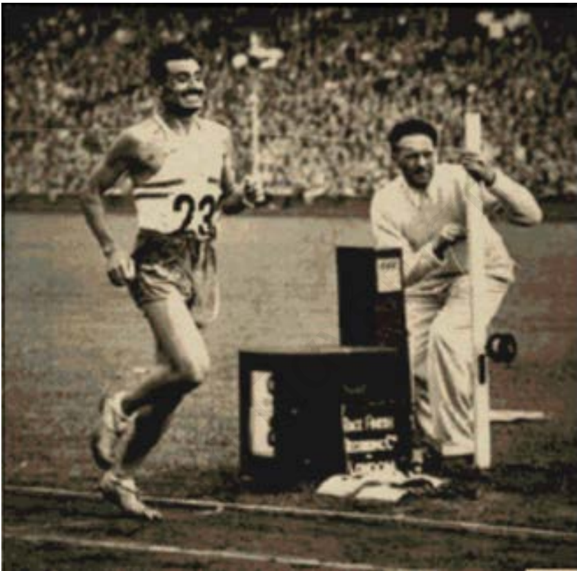
Cabera of Argentina winning to 1948 Olympic marathon