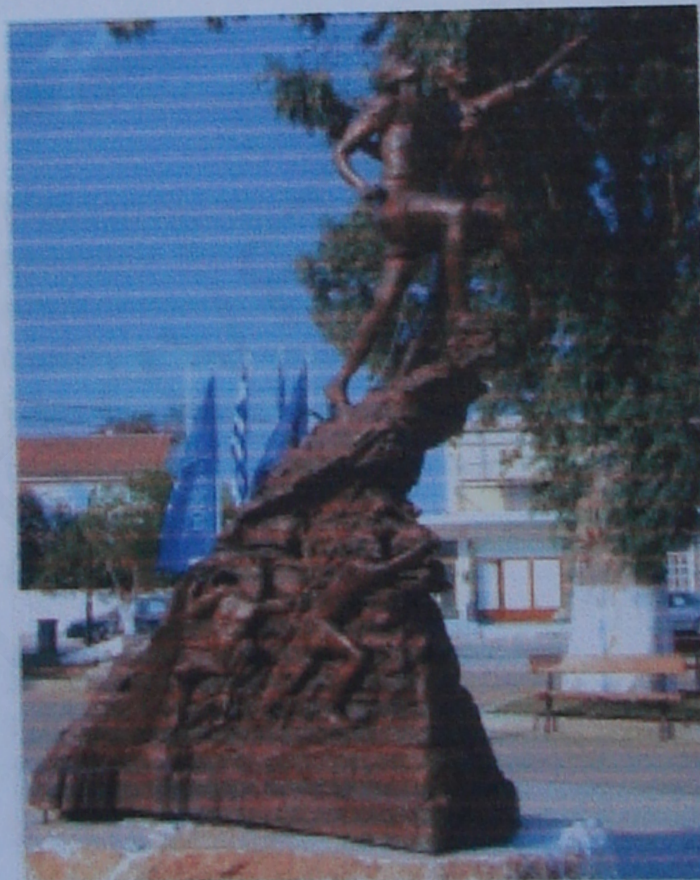
The 'Spirit of the Marathon' statue in the Greek city of Marathon

Hopkinton, Mass., October 24, 2005 – Ground was broken at the Mi Marathon course in Hopkinton for a monumental bronze statue celebra memorable achievements – the 1946 win against all odds by famed Gr Kyriakides. A gift from New Balance Athletic Shoe, Inc. to the Hopkint 10-foot high statue will be unveiled in April 2006 and represents Kyriak Spiridon Louis, winner of the 1896 Olympic Marathon.