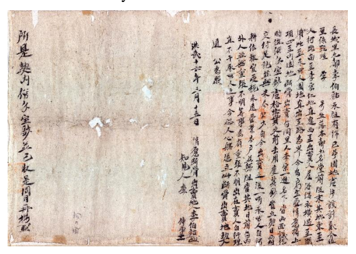
Figure 1 An Example of Local Historical Documents

Local historical documents, also known as folk historical documents, folk documents and so on, mainly come from the daily life of local people. All documents are found and obtained by means of folk collection. These documents are not published or reorganized. This kind of characteristic is close to the nature of archives, they are the words and other forms of materials produced in the course of people's daily activities. Their main forms include contract documents, litigation documents, village regulations, account books, diaries, letters, singing books, scripts, religious ritual books, prescriptions, daily miscellaneous books, etc. which cover a wide range of social, economic, political and cultural fields of folk life<sup>5</sup>. Scholars can get a glimpse of folk historical memory and restore the rich and colourful life of civil society.