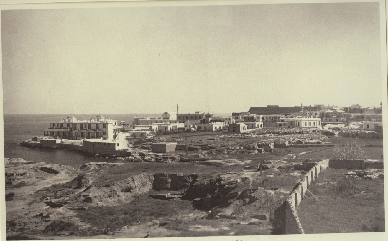
ΚΥΠΡΟΣ - ΚΥΡΗΝΕΙΑ 1950