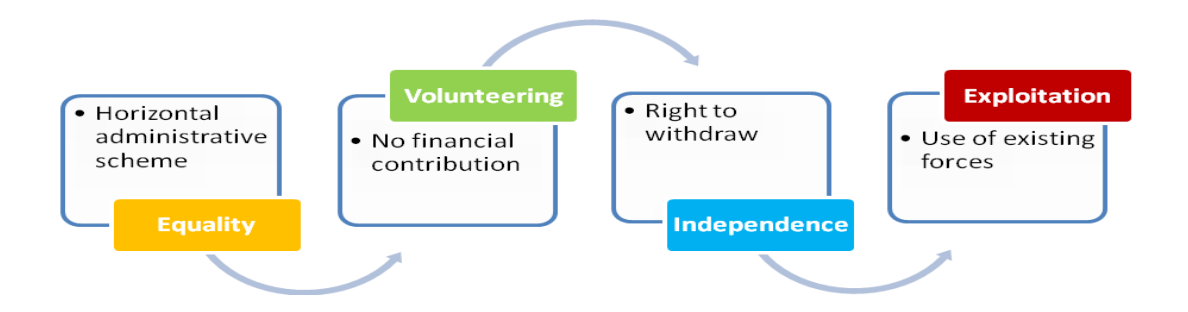
Fig.4: Innovative operating structure