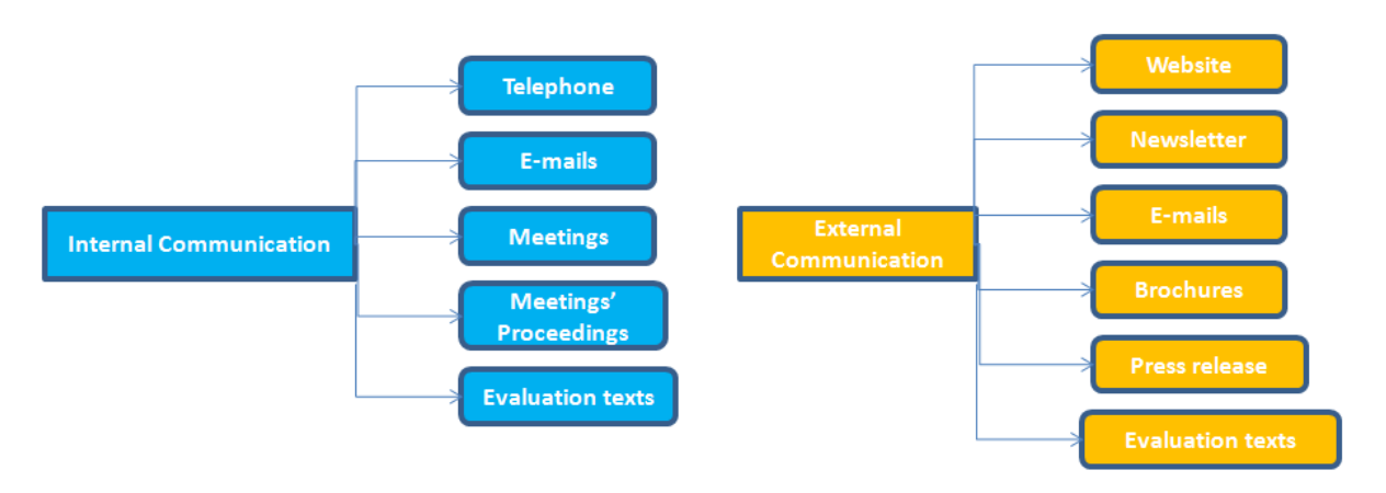
Fig.6: Internal & External Communication means

But the most important communication channel of the Network is the formal announcement and the communication of the actions to the target audience as well as the development of formal and informal ways of informing the public about the benefits of the network. Posts on the H.E.LI.N. website, on social networks and on the members' websites, informing users about the existence of the Network in the context of their research questions, as well as brochures, press releases, and informational messages to professional lists, are means of communicating for the Network. The common Network website is a very important collaborative tool for information about the Network and its members, about actions and events, as well as the communication of each interested person (Delioglou et al., 2017).