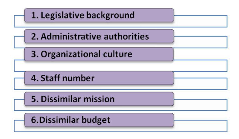
Fig.3: Main challenges in H.E.LI.N establishment