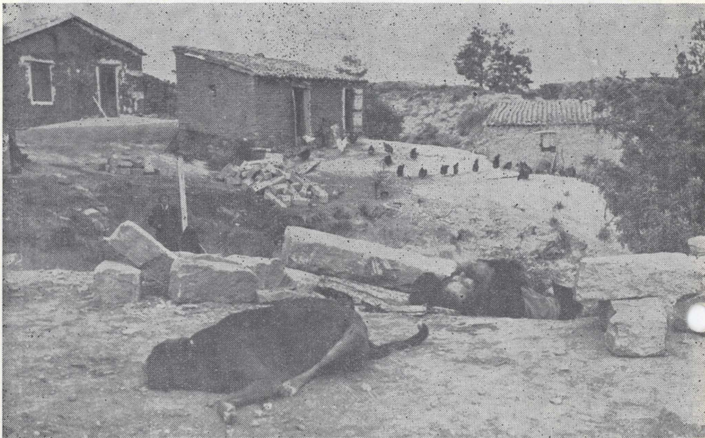
ABOVE : Even the dog did not escape the assassins' fury.