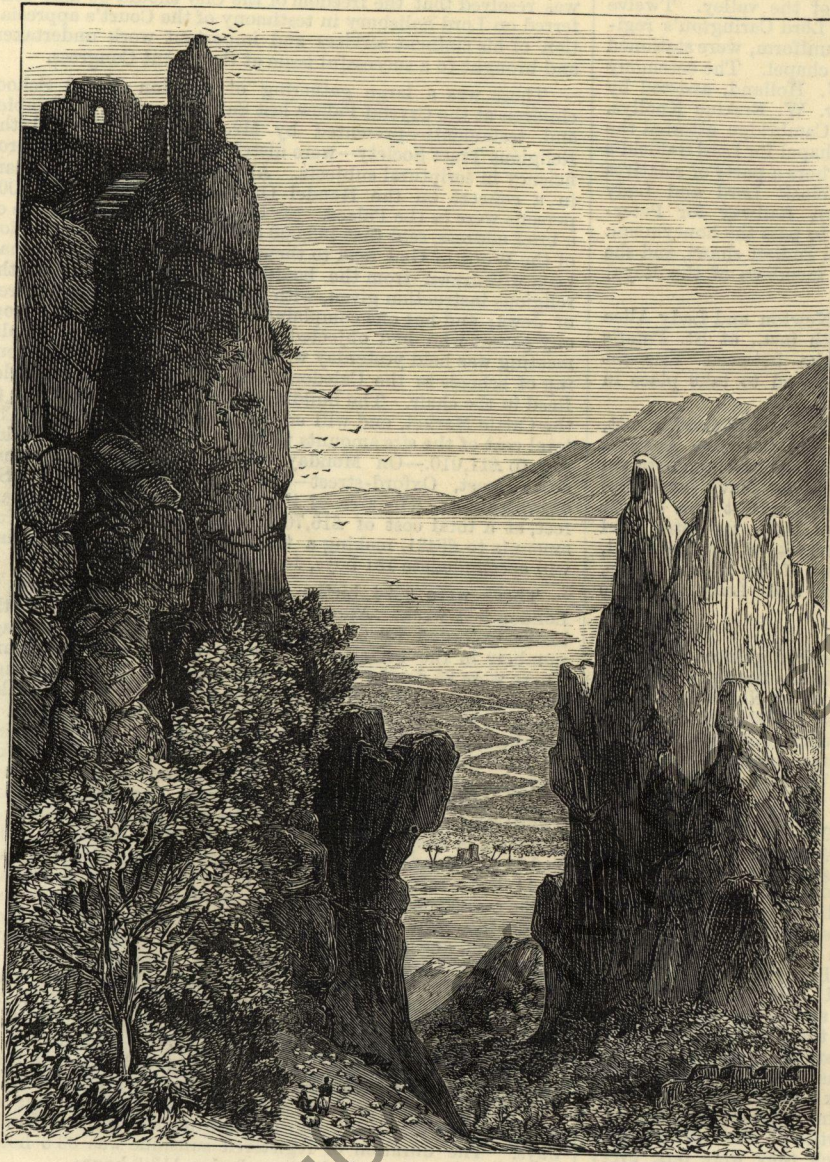
THE "HUNDRED AND ONE HOUSES," BETWEEN LEVKOSIA AND CERINIA.