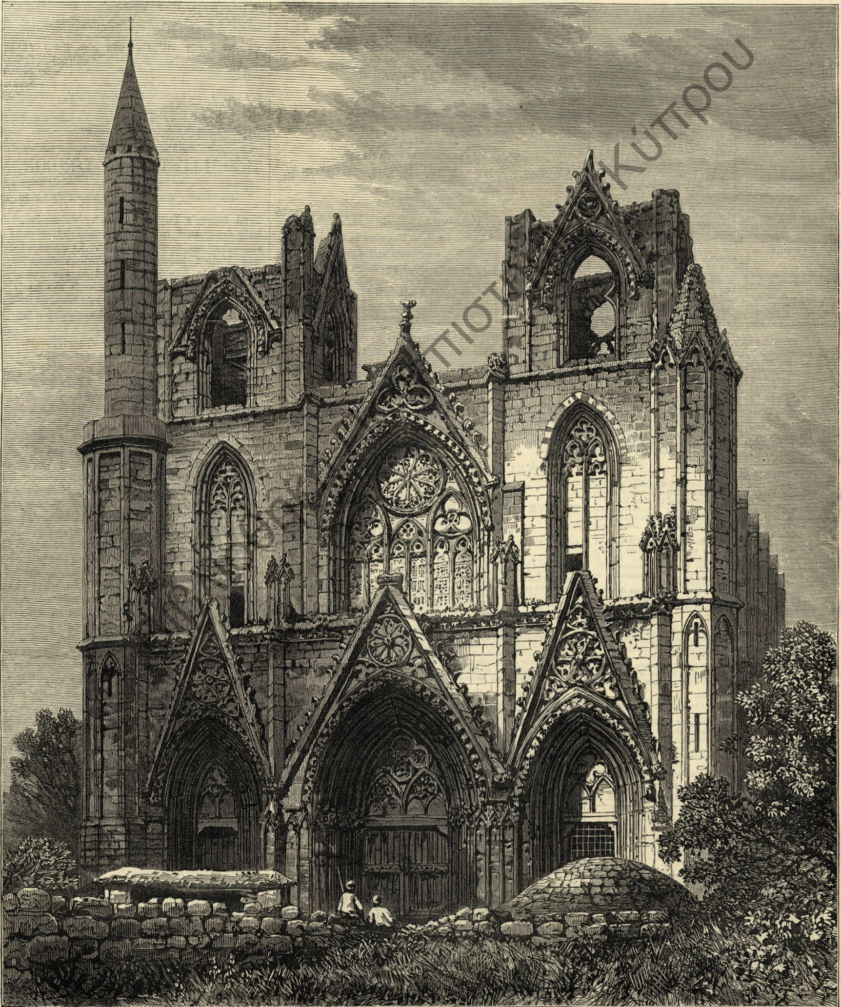
WEST FRONT OF THE CATHEDRAL OF FAMAGUSTA, CYPRUS.

WITH } SIXPENCE. TWO SUPPLEMENTS } By Post, 6 \frac{1}{2} d.