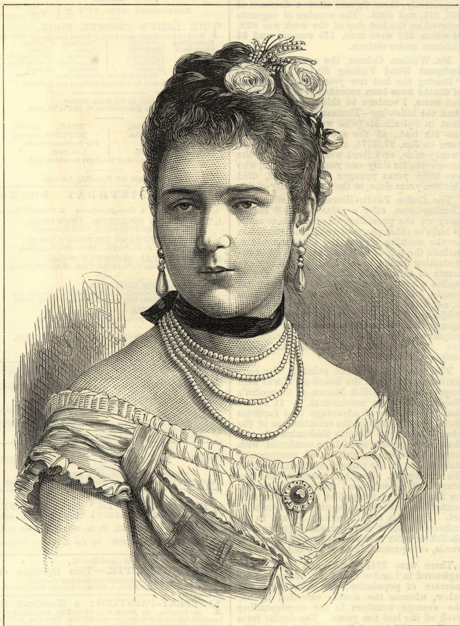
MADAME ETELKA GERSTER.