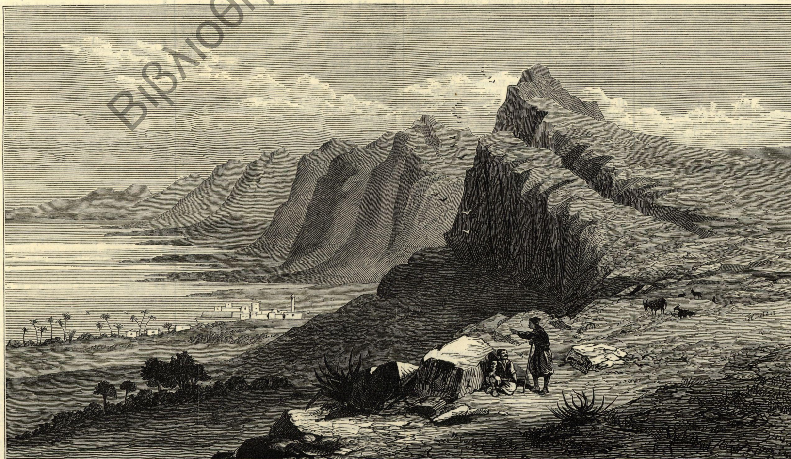
NORTH COAST VIEW, FROM ST. HILARION, OF THE MOUNTAIN CHAIN OF KYRENIA, CYPRUS.

written, in French. Her next triumph was at Berlin, where it may be justly said she turned everybody's head and created a furore such as had hitherto never been known in the German capital, and her benefit night seemed the climax of her many well-earned triumphs. The demand for places was so great that the administration of the theatre was compelled to ask the public to apply by writing, and it is said that more than 21,000 applications were refused. She then made a short sojourn at Buda-Pesth, where she appeared in the operas of "La Sonnambula" and "Hamlet."