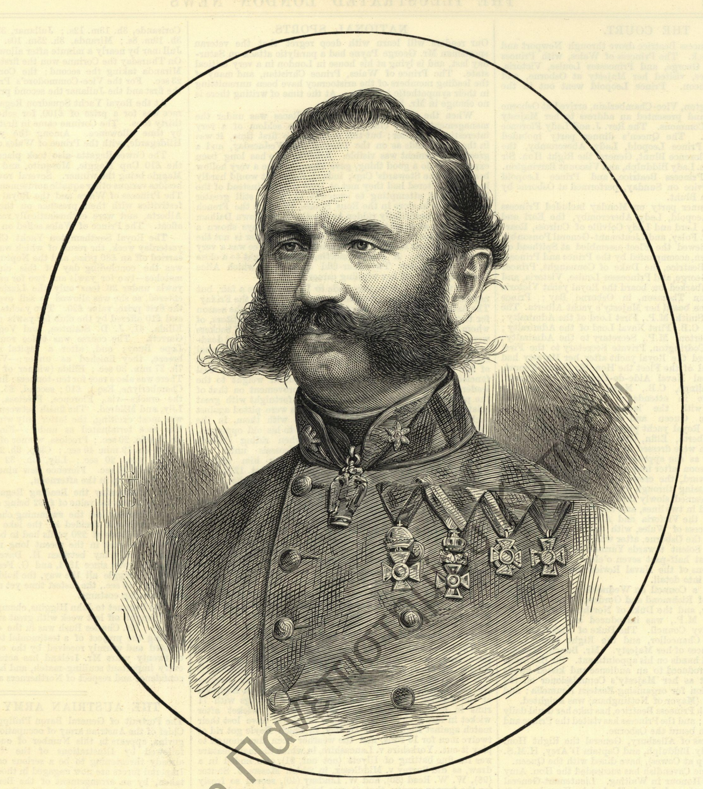
GENERAL BARON PHILIPPOVICH, COMMANDER OF THE AUSTRIAN ARMY IN BOSNIA.