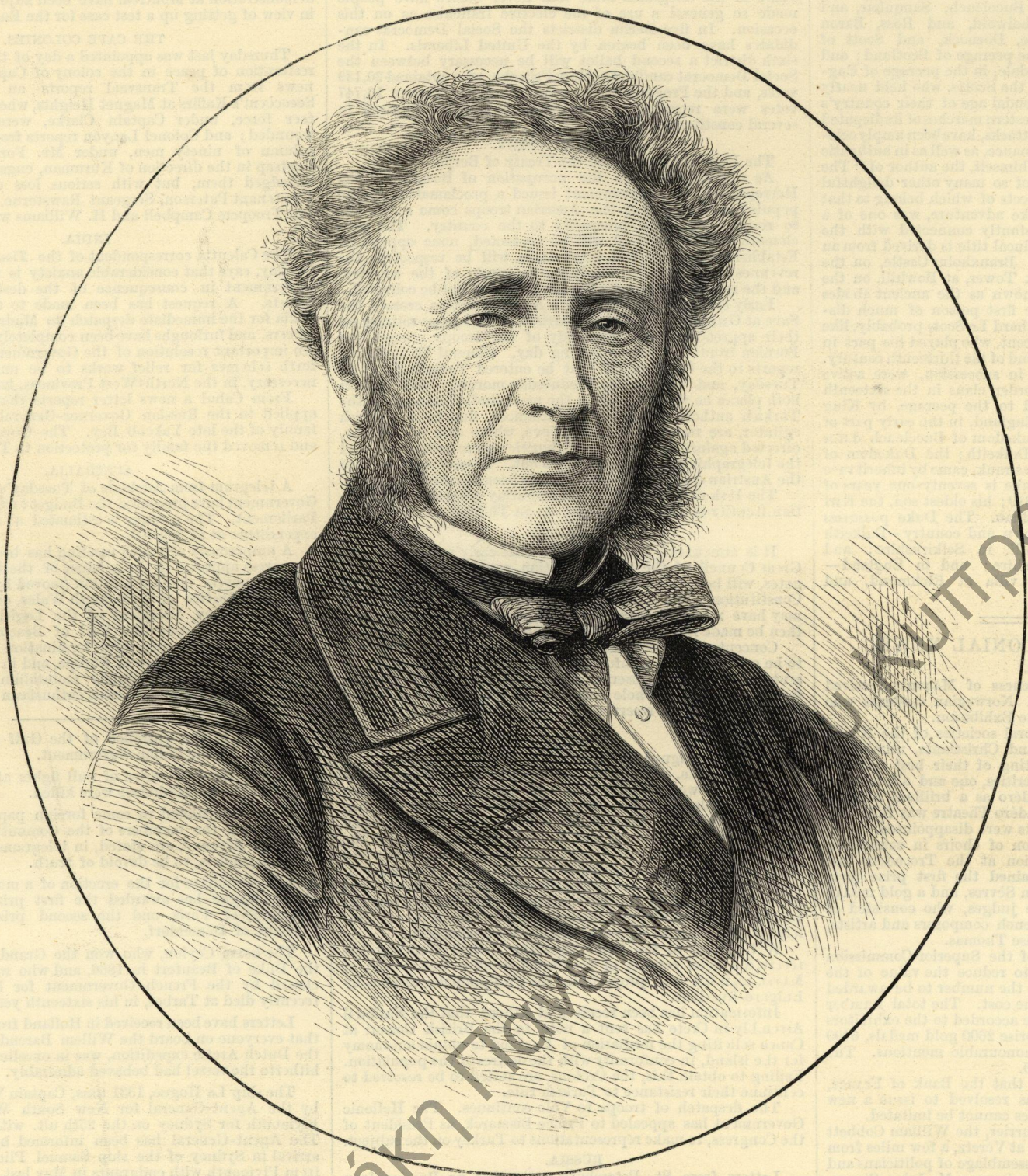
THE DUKE OF BUCCLEUCH, CHAIRMAN OF THE BANQUET IN HONOUR OF LORDS BEACONSFIELD AND SALISBURY.