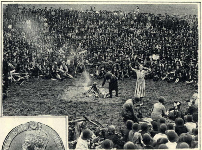
A CAMP FIRE SING-SONG ATTENDED BY 4000 GIRL GUIDES: THE SCENE AT NORWOOD PARK, NOTTINGHAMSHIRE.