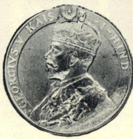
ISSUED BY WARRANT OF THE KING-EMPEROR: THE INDIAN POLICE MEDAL, A NEW DECORATION TO RECOGNISE MERITORIOUS SERVICES.