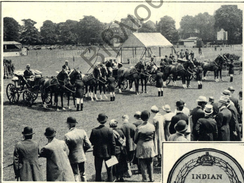
THE RICHMOND HORSE SHOW: A GENERAL VIEW OF THE DRIVING MARATHON, WHICH IS ONE OF THE MOST SPECTACULAR EVENTS.

who was Governor of Bombay from 1918 until 1923. The network of canals and distributaries which the project also entails will water an area of some 6,000,000 acres. The barrage has been constructed at a point two miles west of New Sukkur, below the narrow gorge through which the Indus enters Sind. . . . The total cost of construction is approximately £15,000,000."