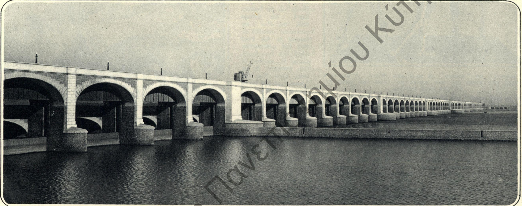
THE SUKKUR BARRAGE IN SIND, WHICH WAS OFFICIALLY OPENED BY THE VICEROY IN JANUARY, NOW COMPLETED: A VIEW FROM THE LEFT BANK OF THE INDUS, SHOWING THE UPSTREAM APRON WITH THE GREAT STEEL GATES LOWERED TO CHECK THE RUSH OF THE WATER.

Our readers will remember that, in our issue of January 16, we published photographs of the Sukkur Barrage, then not quite completed, and recorded its official opening by Lord Willingdon on January 13. We noted on that occasion that the barrage was part of "one of the greatest irrigation schemes of the world, begun in 1923 and named after Lord (then Sir George) Lloyd,