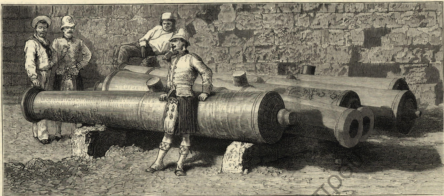
ANCIENT CANNON AT FAMAGUSTA