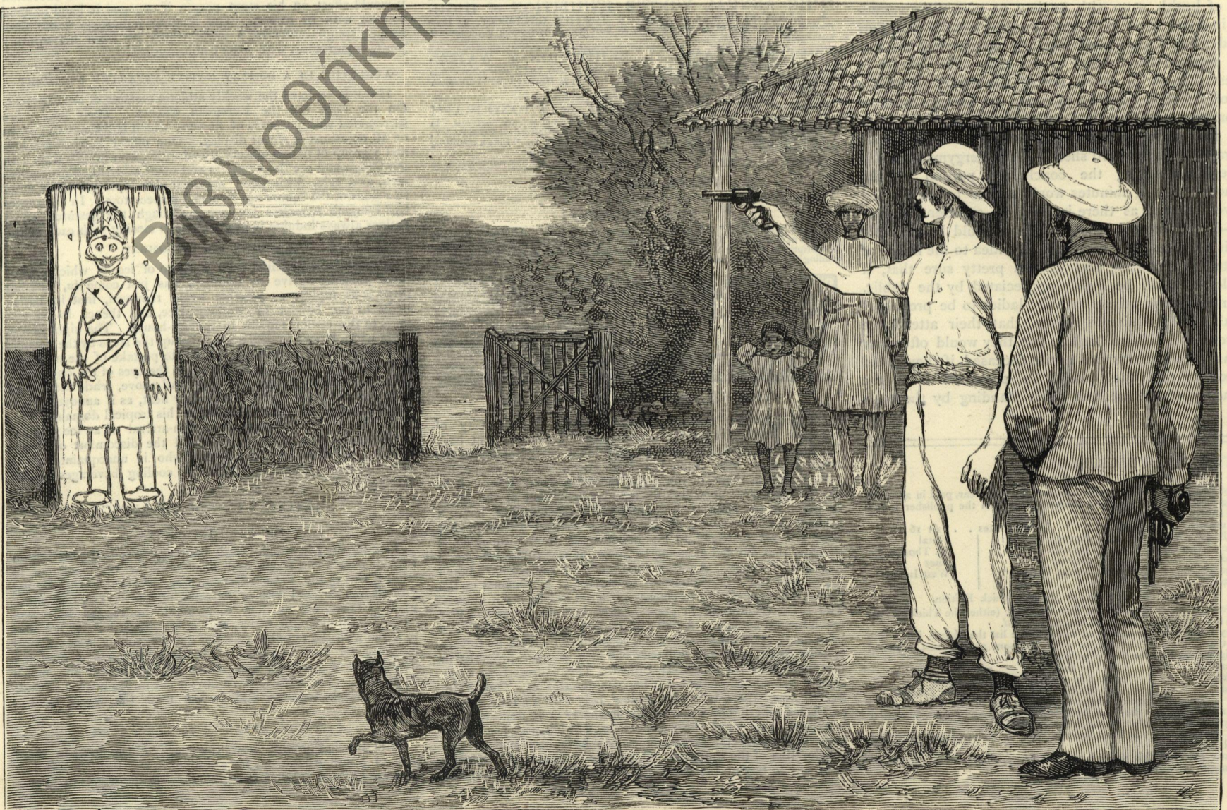
THE AFGHAN CAMPAIGN—PRACTISING REVOLVER SHOOTING AT THE "AMEER"

FROM AN ORIGINAL SKETCH BY JOHN EVELYN IN 1672, IN THE POSSESSION OF THE FAMILY