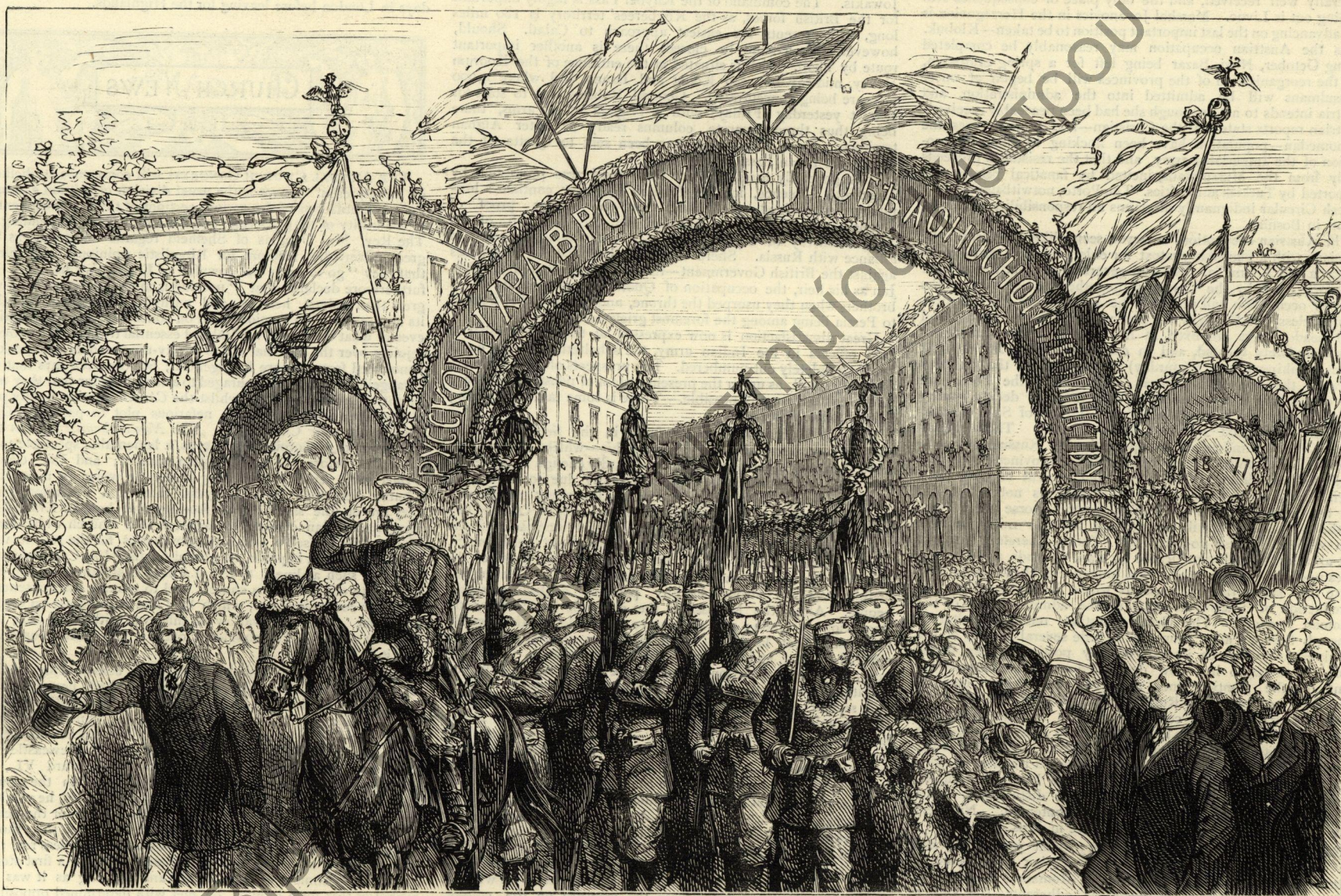
RETURN OF THE FINNISH GUARD TO ST. PETERSBURG