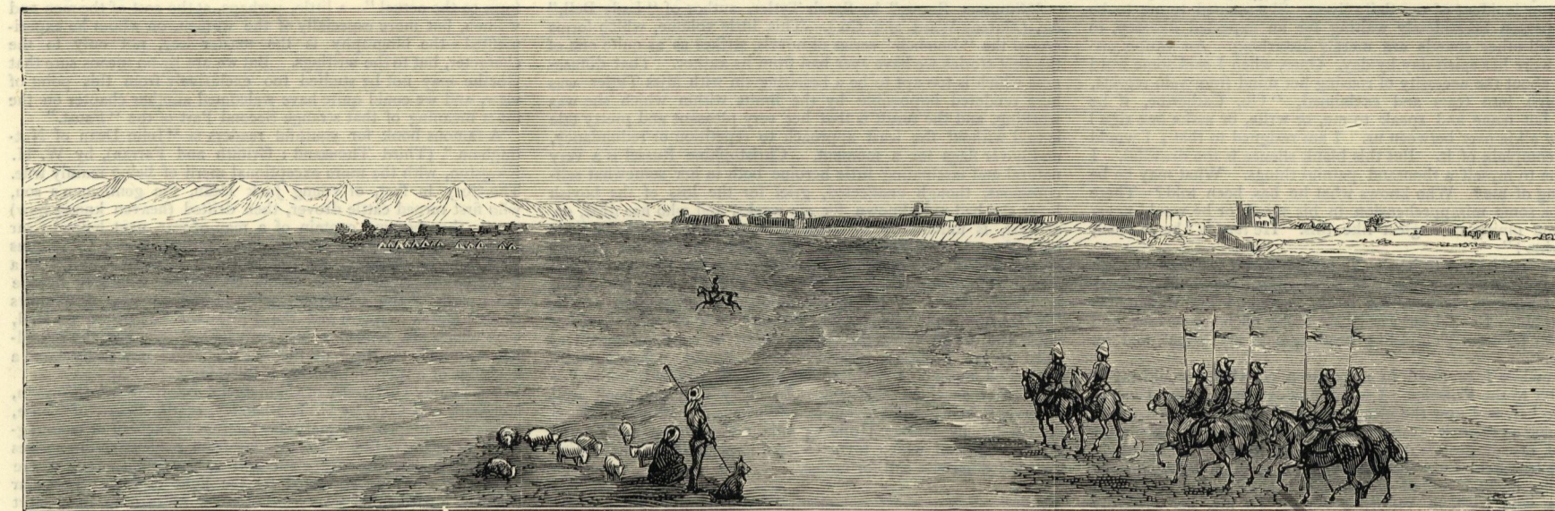
THE TOWN OF FAMAGOSTA