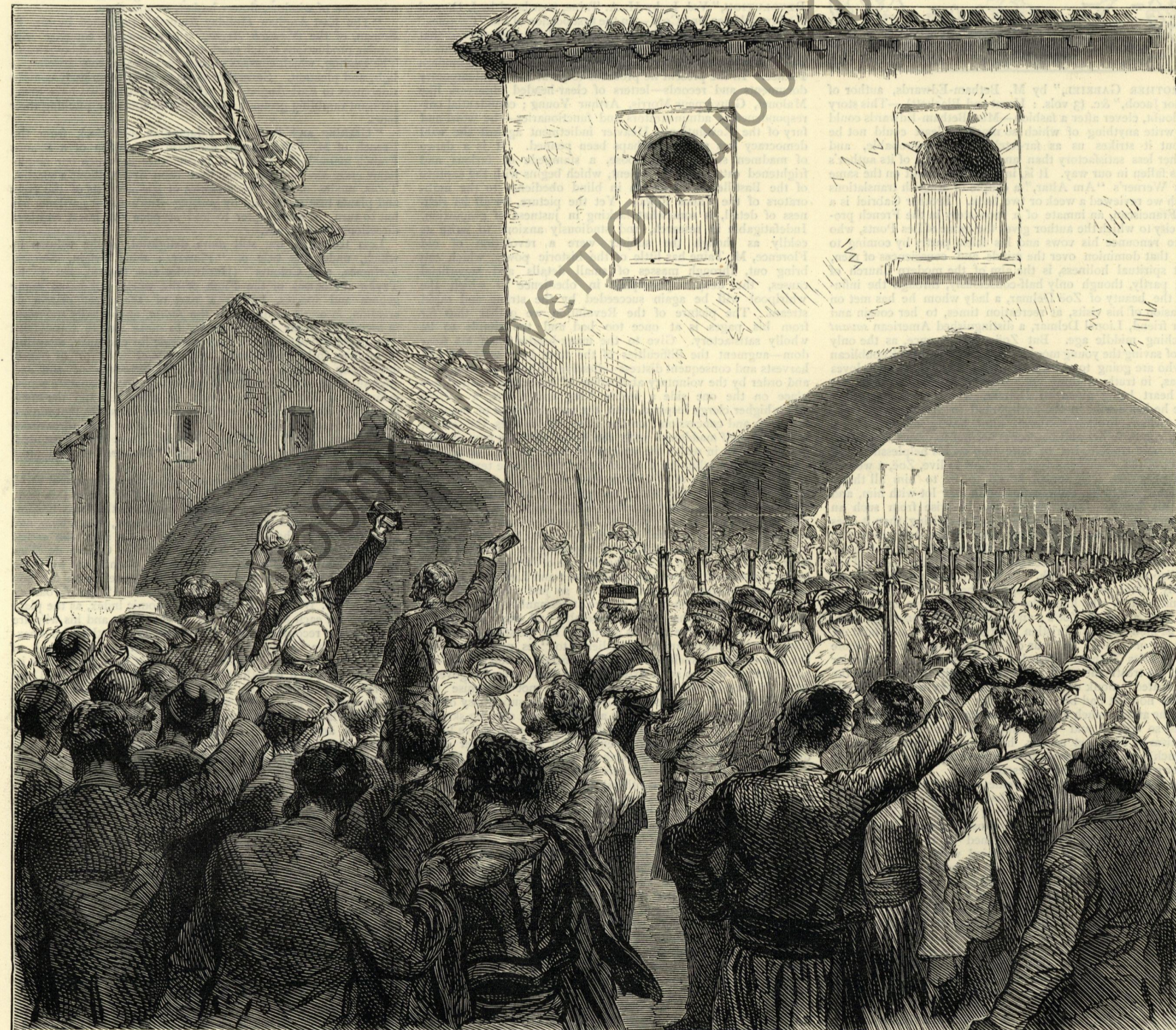
HOISTING THE BRITISH STANDARD AT NICOSIA

The new edition of the "Cyclopedia of American Literature" is published by Scribner's Sons.