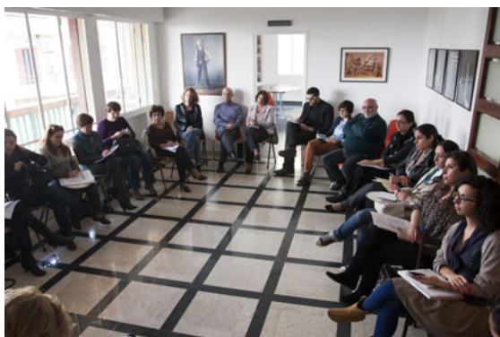
MoHO national networking meeting #1 Beirut, March 2012

In March and June 2012, the Arab Image Foundation hosted networking meetings bringing together actors in cultural heritage preservation in Lebanon. Over 30 participants attended the first networking meeting, which served to inaugurate the MoHO initiative. The meeting focused on identifying shared needs and concerns among the actors of cultural heritage in Lebanon, and aimed at building the basis of the network and discussing common goals and objectives. Building on the concerns identified, participants were then asked to fill in a survey assessing their needs and detailing their expectations from the network. Accordingly, the second networking meeting addressed two critical topics that had emerged from participants' answers: emergency preparedness, and the need for a common visibility and communication strategy. As emergency plans are a key tool for archive repositories, network members decided on creating working groups, where those holding comparably-sized archives of similar media will together develop emergency salvage plans.