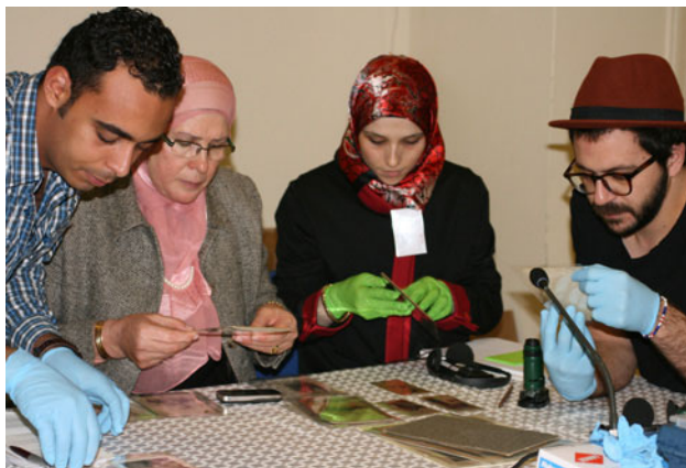
MEPPi Beirut 2011 participants

During its new cycle, MEPPi also proposes three photograph preservation courses over three years. The first MEPPi course, MEPPi Beirut 2011, was attended by 18 participants from leading photograph collections of the Greater Middle East, including national archives and libraries, museums, press agencies, and universities in Egypt, Iraq, Iran, Jordan, Lebanon, Morocco, Palestine and Syria.* Participants and instructors engaged in theoretical and practical sessions covering the identification, preservation and display of photographic materials, both analog and digital. Participants were provided with preservation toolkits and sample housing materials. Selected participants were also provided with state-of-the-art environment monitoring data-loggers, to gather data on storage conditions. The workshop included collection visits to the American University of Beirut, the Arab Image Foundation, and Studio Shehrazade. A public talk at the Beirut Art Center addressed the critical challenges and best practices associated with digital print preservation.