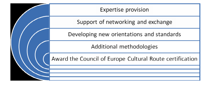
Figure 1. Policy-making and standard setting

EICR prepared in the past a report for Congress of Local and Regional authorities (CPLRE of Council of Europe) reflected in the adopted resolution on 'Cultural tourism, element of promotion of sustainable development at local and regional level'.