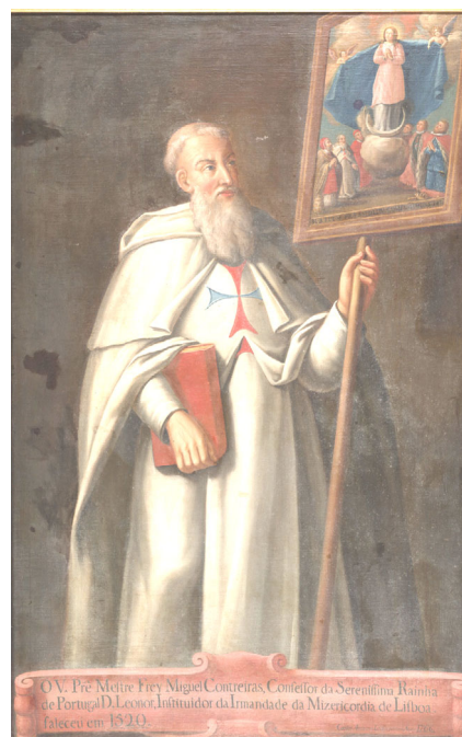
Figure 3: Carlos António Leoni, Portrait of Fray Miguel Contreiras, 1766, oil on canvas, 187,5x125cm, National Library. Painting restored in 1864 and in 1888.