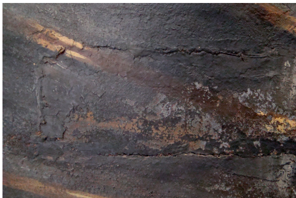
Figure 5: Portrait of D. Afonso Henriques. Detail of repaints on armor.

Overall, the intervention criteria followed does not correspond to the present criteria, especially the respect for original materials and the use of reversible and compatible materials that do not affect the original work.