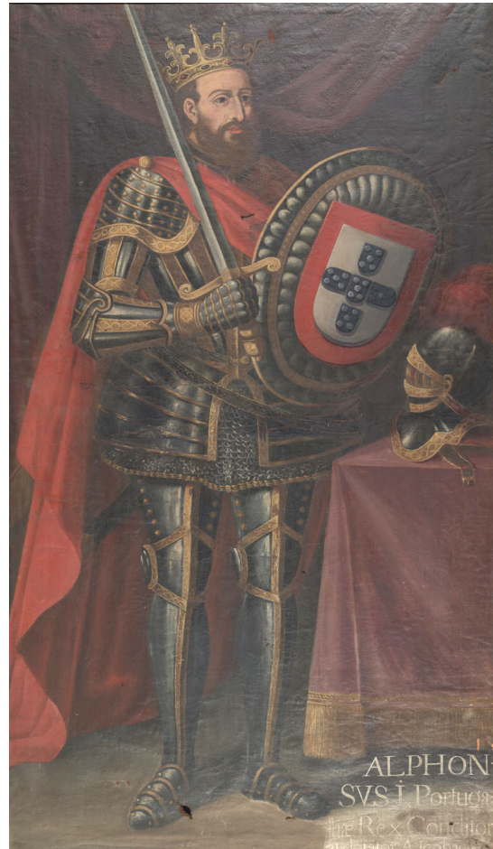
Figure 4: Unknown Author, Portrait of D. Afonso Henriques, the first king of Portugal, seventeenth century (?), oil on canvas, 224x133 cm., National Library.

encyclopaedic works which confirmed that these were extremely aggressive. On one hand, the cleaning of easel paintings consisted in using brushes and sponges; and, on the other, it could employ the use of bleach, turpentine, whitewash or hot water, among other substances (Rodrigues, 2007; Serrão, 2006). It is possible that the procedures and materials used were similar to those in other countries.