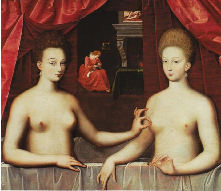
Figure 1. School of Fontainebleau (16th century), Gabrielle d'Estrées and one of her Sisters , c.1594. Oil on wood panel. Louvre, Paris.