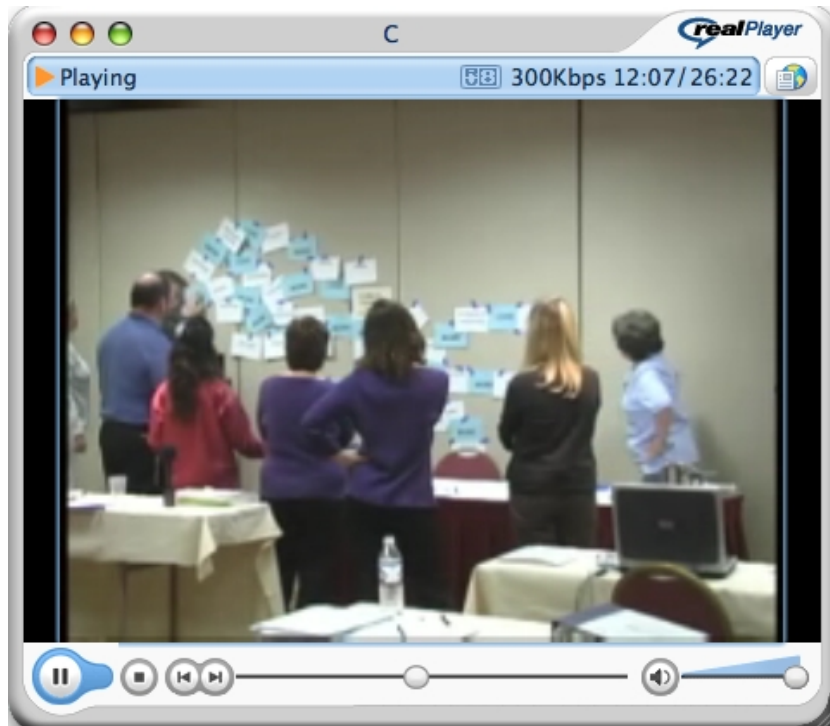
Figure 4. Scene from streaming video of teachers debriefing a curriculum activity