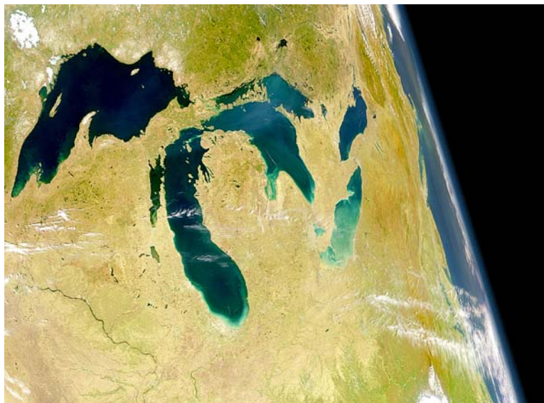
Figure 2. Satellite image of the Great Lakes

The program reported here is the product of COSEE Great Lakes, in the region which is home to one quarter of the nation's population. COSEE Great Lakes has the additional goals of speaking for the Laurentian Great Lakes as an inland sea (Figure 2), and improving Great Lakes education in the eight-state region. The Great Lakes coastline is as long as the U.S. coastline on the Atlantic Ocean. Five COSEEs are located on the Atlantic shore and only one is on the Great Lakes. The COSEE Great Lakes task of teaching about the inland sea (or Fourth Coast) is a geographically immense and scientifically essential one.