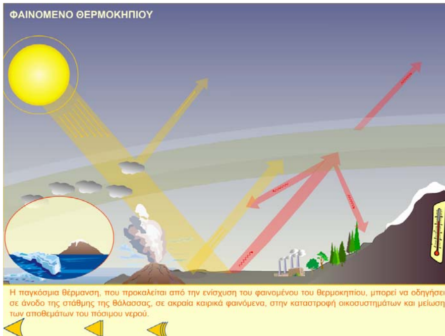
Figure 3. A simulation of the greenhouse effect developed for the thematic unit General principles and concepts of RES .