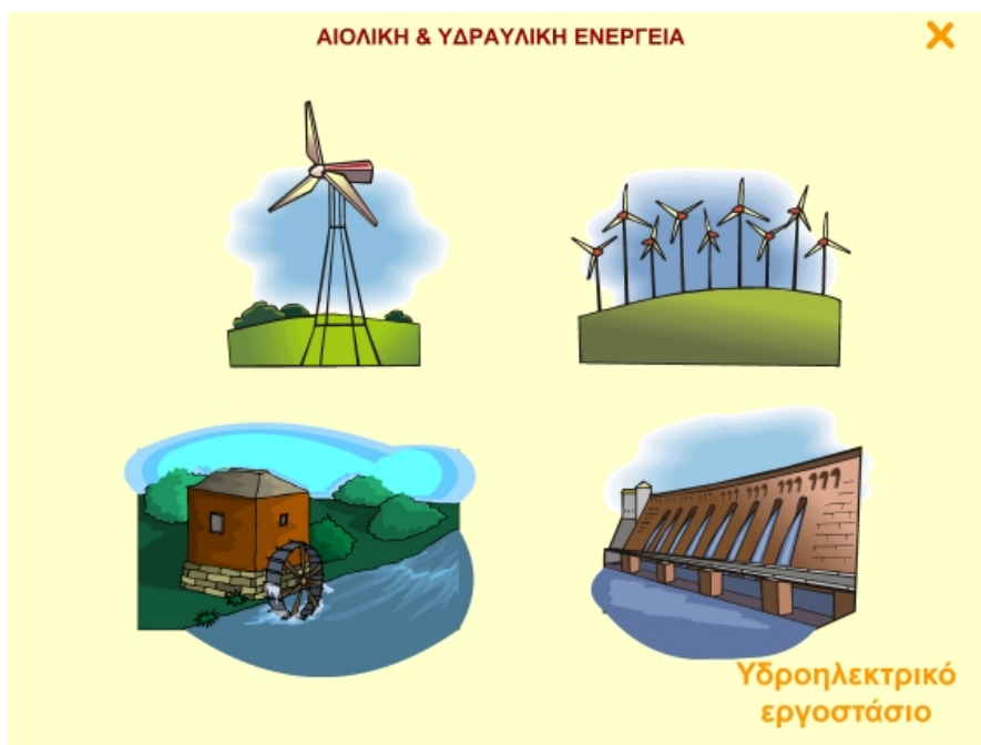
Figure 2. The main window of the activities developed for the Kinetic Energy thematic unit

All activities were developed in Macromedia Flash, in order to create small files, capable of being run independently in most PCs through the internet. For the same reason, most applications and simulations developed are pseudo-three-dimensional or two-dimensional. A standard interface model has been developed, which has been applied to all thematic units. This consists of an introductory main window, from which the user chooses the application and/or simulation he will use. The window consists of active components and each activity offered is represented with pictures, as shown in Figure 2. When the user chooses a specific activity to pursue, it opens in the same window. All activities share the same interface, in order to minimize the time required for the user to learn its use.