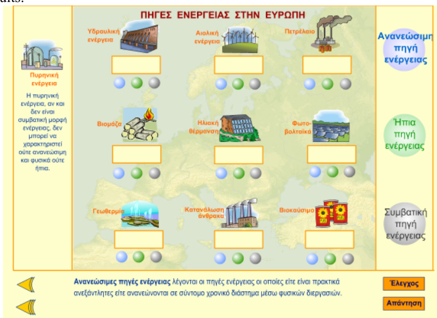
Figure 5. An application developed for the thematic unit General principles and concepts of RES

user with its use. In the activity show in Figure 4, the user is able to virtually perform the experiment and obtain results.