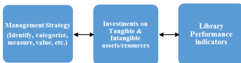
Figure 2.2 Library intangible asset management framework

This value creation process can utilize new intangible assets or discard others, thus creating a need for repetition of the above-mentioned process. According to the above approach intellectual capital contributes in value creation within libraries, and the intellectual capital management deals with the “hidden” capital that is not recorded in the balance sheet. Therefore, it is based on the fact that the real value of a library is not the one presented in the balance sheet of assets. The library’s true value is best expressed as the total of its financial value with an estimate of the value of its intellectual capital (Kostagiolas, 2012).