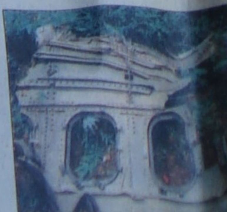
The wreckage of United Flight 93 in Somerset County, Pa., shown in an image from a court exhibit.

But as the fate of admitted al-Qaida terrorist Zacarias Moussaoui plays out in a federal courthouse in Virginia, those left behind are coping in very different ways as the defense attempts to convince a jury to spare his life. And they all want him to know