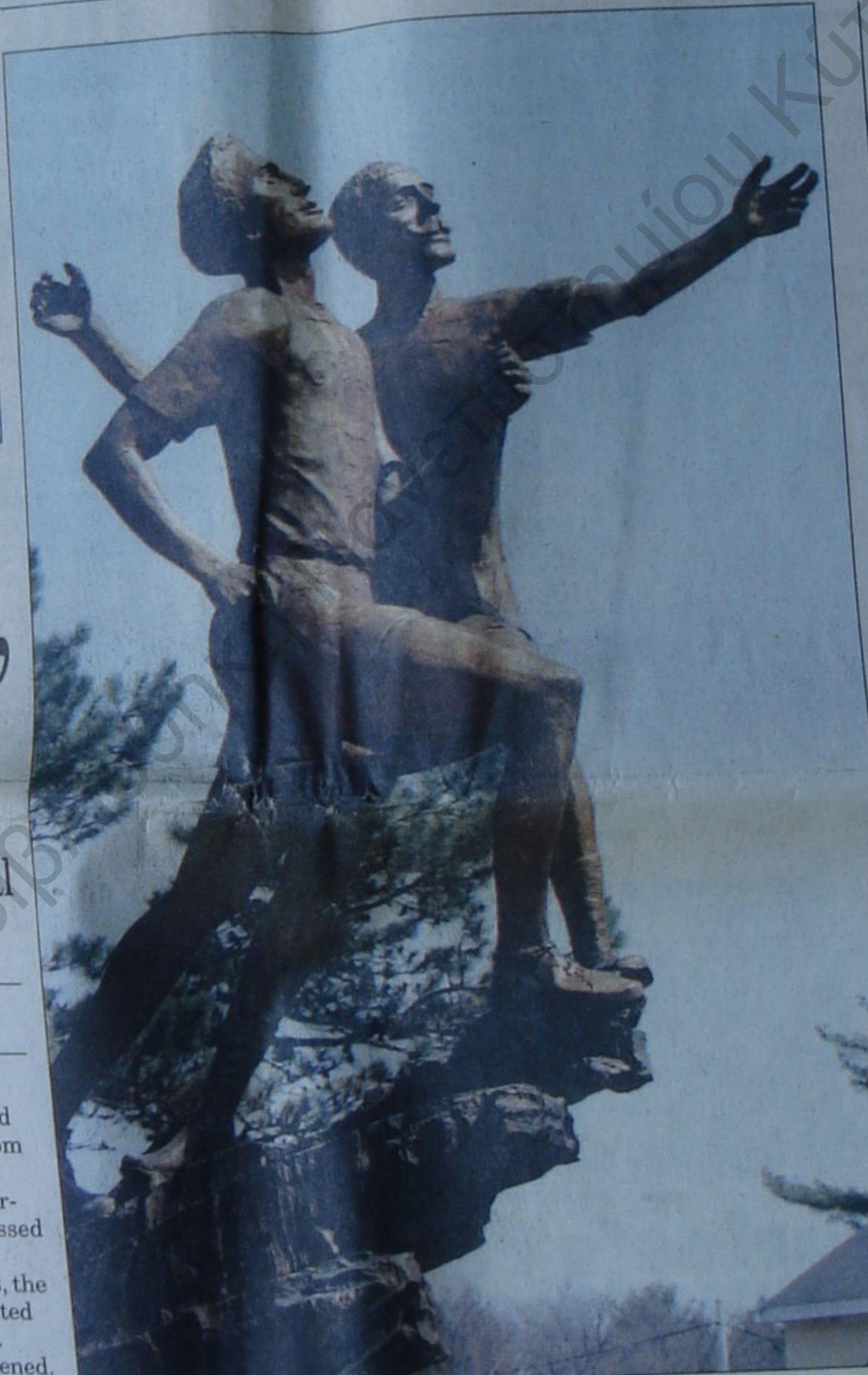
The Spirit of the Marathon shows Stylianos Kyriakides, left, on his way to winning the 1946 Boston Marathon, guided by Spiridon Louis, who won the first modern Games in Athens in 1896.