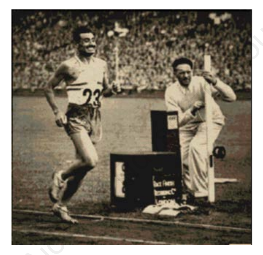
Cabrera of Argentina winning to 1948 Olympic marathon