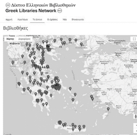
Figure 3. Network.nlg.gr website - Mapping the Libraries of GLN

From 2017, the website has gradually begun to develop into a platform of education, information and communication. The information meetings of the NLG with its members are now on live streaming, live chat and even on live link with the libraries via skype. Sessions on the use of new technologies and the management of social media tools are consistently included in the training of library staff, which takes place online every year.