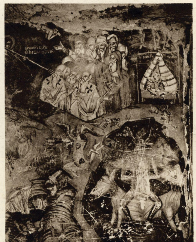
HELL IN PYRGA CHURCH : A COMPOSITION OF NOT UNCOMMON IN THE OLD RELIGIOUS BUILDINGS OF CYPRUS, ESPECIALLY IN THE ORTHODOX CHURCHES. KIND NOT

Match me such marvel, save in Southern clime, An amber city, victor still of Time.